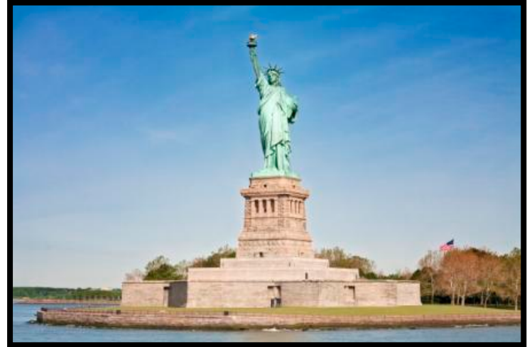
Statue of Liberty, 1886 Auguste Bartholdi, Sculptor