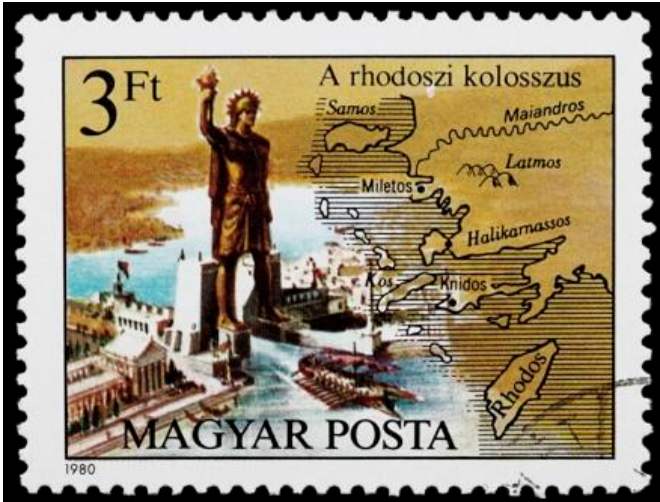
Colossus of Rhodes, ~304 B.C. Wonder of the Ancient World

How do allusions help to unlock the meaning of a poem?